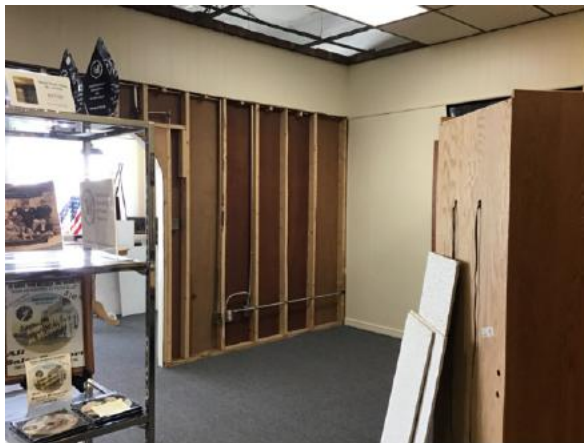
Room 2 west wall sans paneling

In case you didn't know it, the Museum has dry-wood termites (the flying kind) again. They appear to be in the wall between Rooms 1 and 2. None of the termite people could find traces anywhere else. They all agreed that the only way to guarantee all the critters are killed is to tent (then gas) the entire building. However, that meant that the entire city block would need to be tented since we are interconnected. That's not going to happen! APEX Termite Control was selected but said we would need to remove all the Room 2 paneling on the west wall for access to the wood. So, the wall (and ceiling tile) was removed and trashed. The treatment was completed July 24 th and now we are in process of replacing the wall, painting it and replacing ceiling tile. Eight months ago, APEX told us then they felt we should remove the wall for best access but that would have shut us down for a couple of weeks so we elected to try a "spot treatment" and hope that would fix the problem. Guess that didn't happen. The problem was bigger than we thought. Just hope none of them have decided to take up residence in some of our wood furniture.