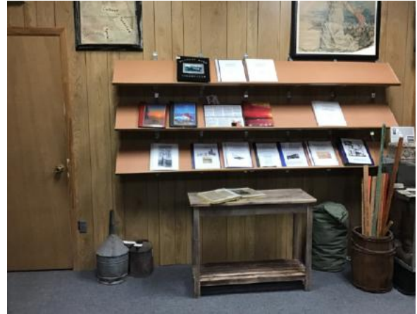
Room 4 display shelving

Additionally, Room 4 has undergone a few changes. The tool area has been revamped utilizing the Pritchard display case. The shelf that held a few tools has been moved to the south wall. There, the shelves have been transformed into a usable document display for easy access by visitors.