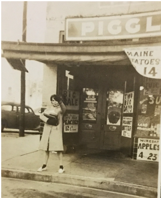
Museum was the former location of our local Piggly Wiggly grocery store

We have a new addition to the kitchen area in the Museum. A full-page ad for the Piggly Wiggly grocery store. In case you didn't know, the Museum was the former location of our local Piggly Wiggly grocery store. Although no date was found on the ad, after careful research we feel this ad was from the 1940's because fresh peaches were 11 ½ cents a pound and Mullet was 3 pounds for 25 cents! Don't you wish those prices would come back today! We are very fortunate to receive donated gems from the past. As we get them, we tuck them here and there all over the Museum. Come on down and look around and see if you can spot them. Admission is Free!