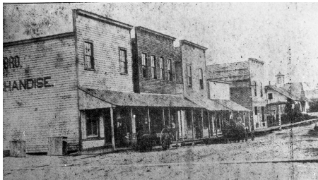
Brady Bros. Groceries