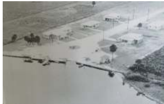
Myrtle Park postcard

We have been very busy in the renovation of the Museum, and going through a lot of historical pictures. I found a postcard of a development called "Myrtle Park". The back of the postcard says this development was one mile south of Haulover Canal. NASA used the process of Eminent Domain to acquire this property and others on Merritt Island in the late 1950's-1960. I know a lot of my friends who were displaced by NASA.