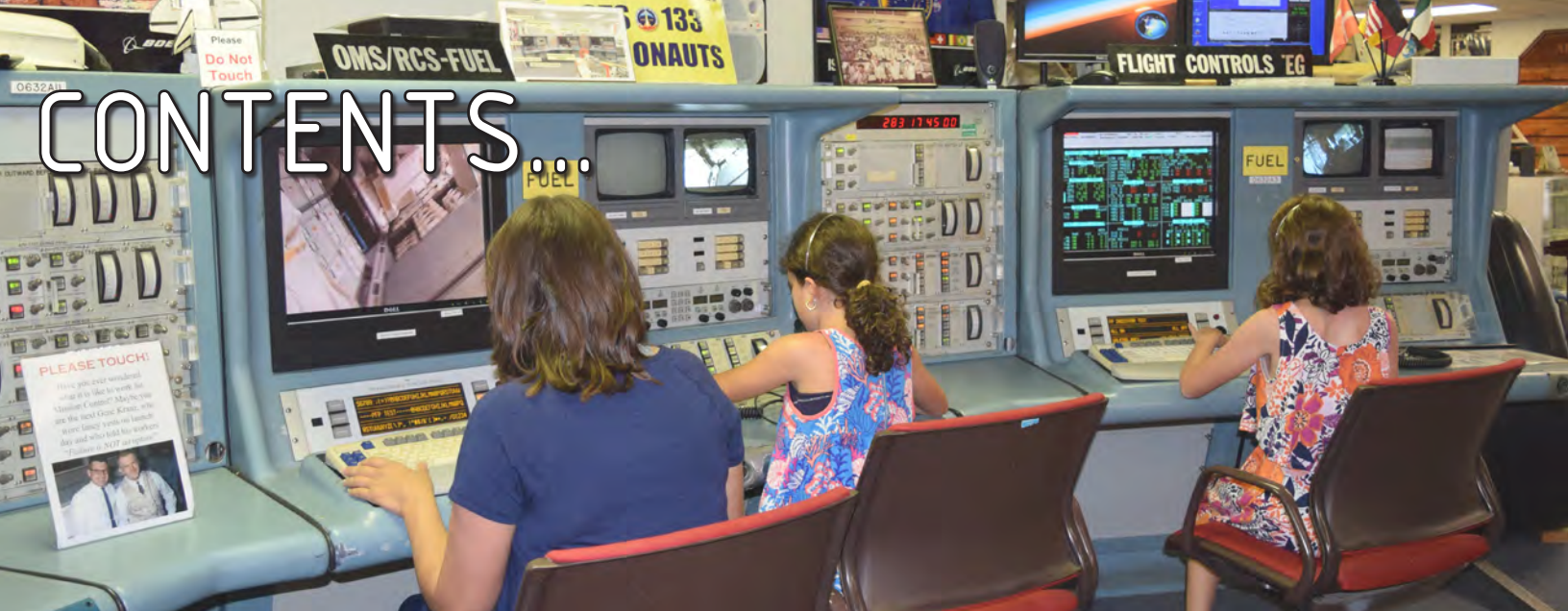
Above: A family gets a glimpse of being mission controllers while visiting the American Space Museum in Downtown Titusville.