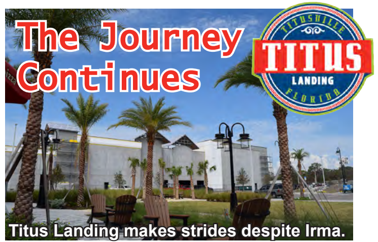
Titus Landing makes strides despite Irma.

Once preparations are complete, the center is set to open at the old Whispering Hills primary school, located off of South Street. We're excited for this new program and look forward to seeing its progress!