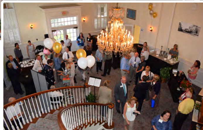
Guests gather inside the historic Bank of Titusville and Trust Company building for the announcement by Red Canyon.

Launch Now will be completed in phases, with the first phase consisting of reactivating and re-imagining the historic Walker Hotel and adjoining bank located along South Washington Avenue. The renovations will include converting the top two floors into 20-24 boutique-style apartments, which will provide housing for the company's employees and other individuals who wish to live in the downtown area. Plans also specify a collaborative workspace for the development of new software and other technologies for the aerospace industry.