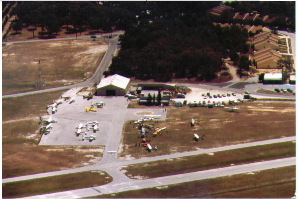
Dunn Airpark 1986

There are ten students in our ground school and we have an instructor who comes over from Kissimmee Wednesdays and Saturdays."