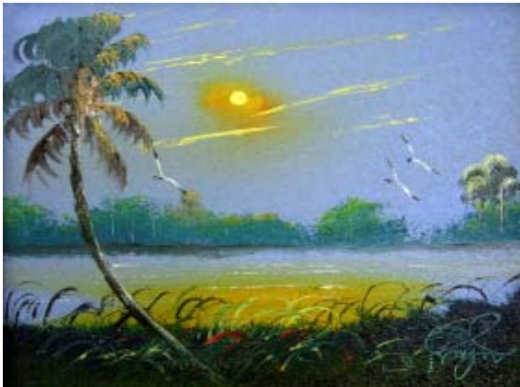
Untitled - Issac Knight 8x10 Oil on Canvas - Retail value $375