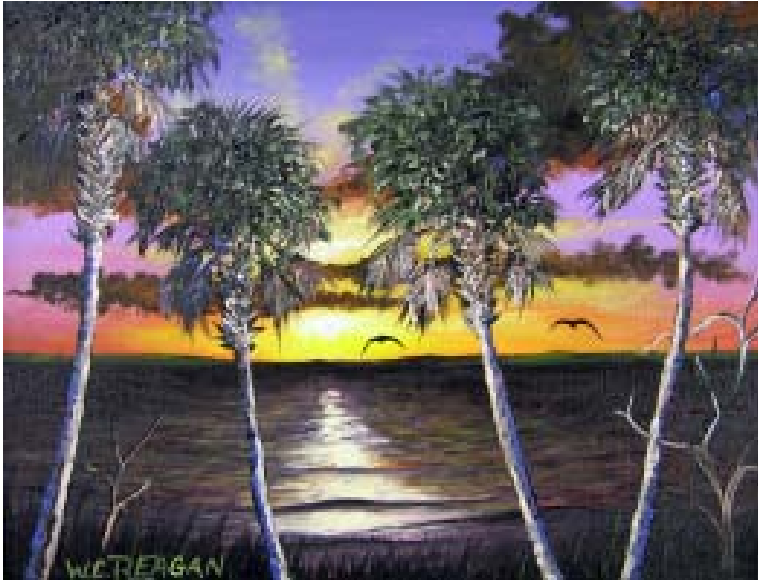
Indian River Sunrise - W.C.Reagan 8x10 Oil on Canvas - Retail value $350