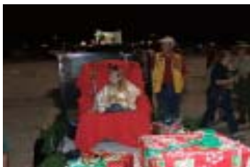
Let's get this party rolling!