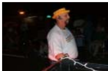
The camera adds about ten pounds I think! Nice hat though!