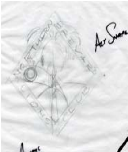
Original Concept Optional shape.

Here are the 4 work ups for our logo - The overall vote has been for the left hand drawing with some changes .