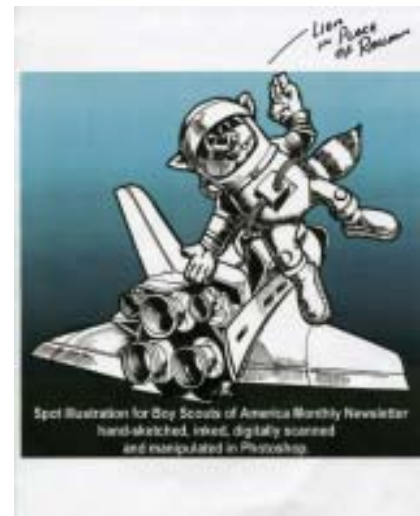
Racoon in suit can be replaced with Lion. My vote is this is too complicatd for pin.

Believe, when you are most unhappy, that there is something for you to do in the world. So long as you can sweeten another's pain, life is not in vain.