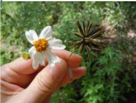
Bidens Alba—Flower and seeds

(Phew...all that to say this — that the plant is in the wrong place.