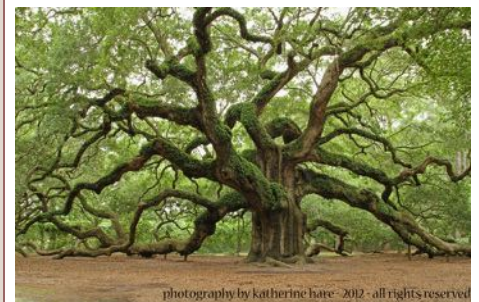
"The Majesty" (Angel Oak)

living 1,500 years. Imagine the stories this tree could tell. The Live Oak was a sought after tree for shipbuilders, as far back as the early 1700s, because of its resistance to viruses and rot. Wooden ships built of Live Oak were known to last 50 or more years over the life of any other wood. Live Oak is hard, its density making it harder than many other oaks. The United States Government set aside thousands of acres of Southern woodlands to protect the live oak from other lumber interests. That's another story and can be found on a National Park Service web site: