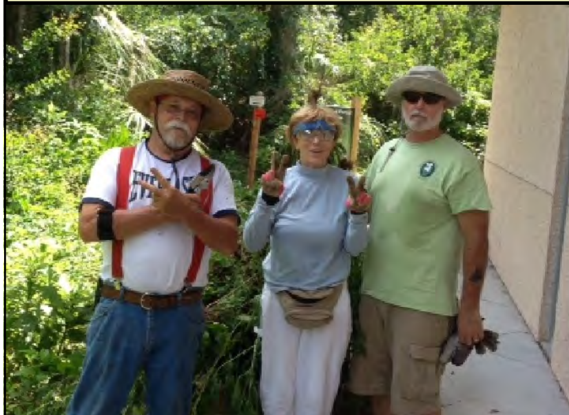
Intrepid Nursery Team (L to R)