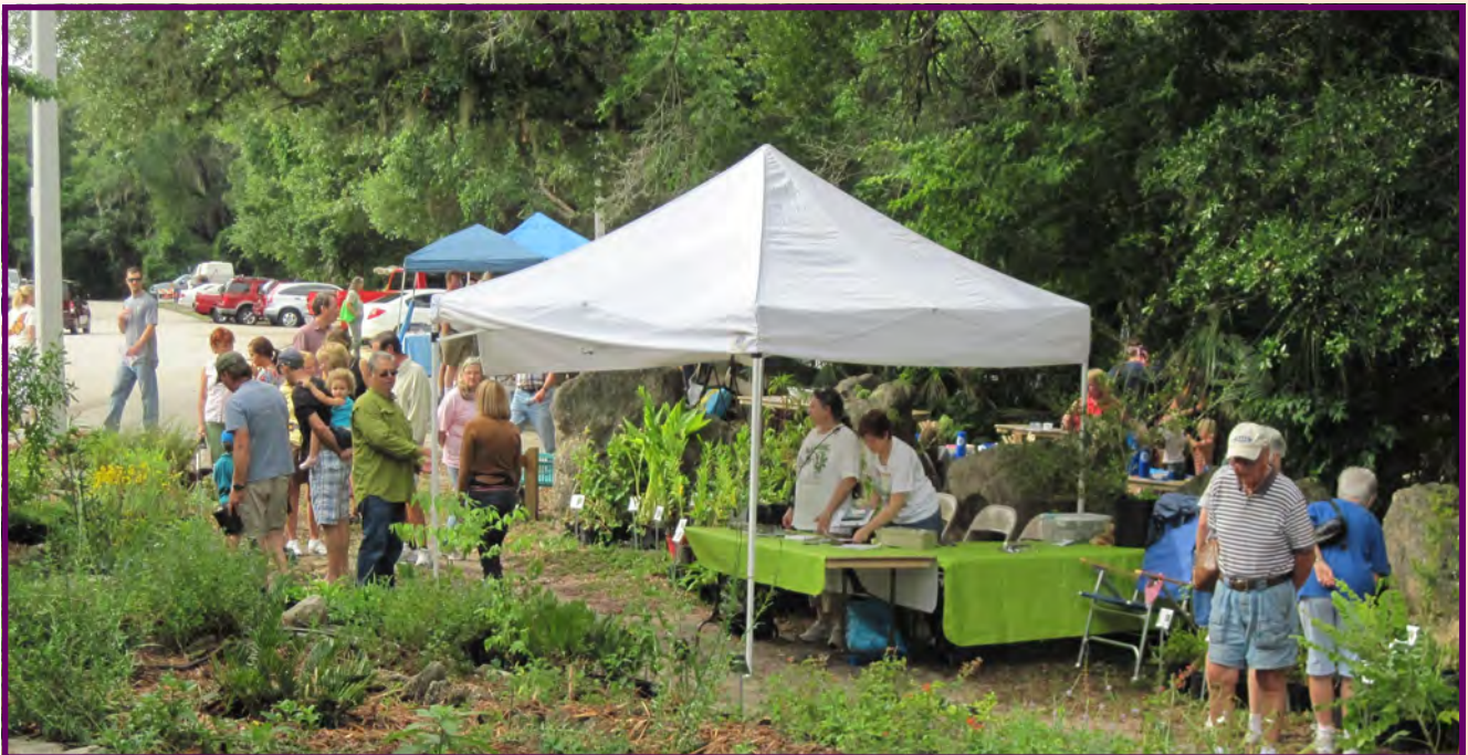
Earth Day Plant Sale, Enchanted Forest, April 2012

We'll be forming a workday schedule that will include some Saturdays, so don't hesitate to let us know which part of this project you'd like to get involved in. There will be something for everyone! We hope that you'll consider volunteering for a plant sale in the near future; we try to make the experience fun and fulfilling, and it's a great way to help your Chapter! Thanks for all you do!