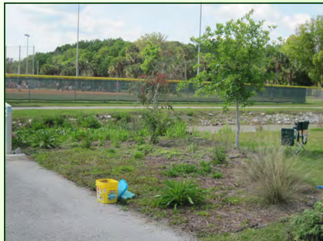
A work in progress... (right)