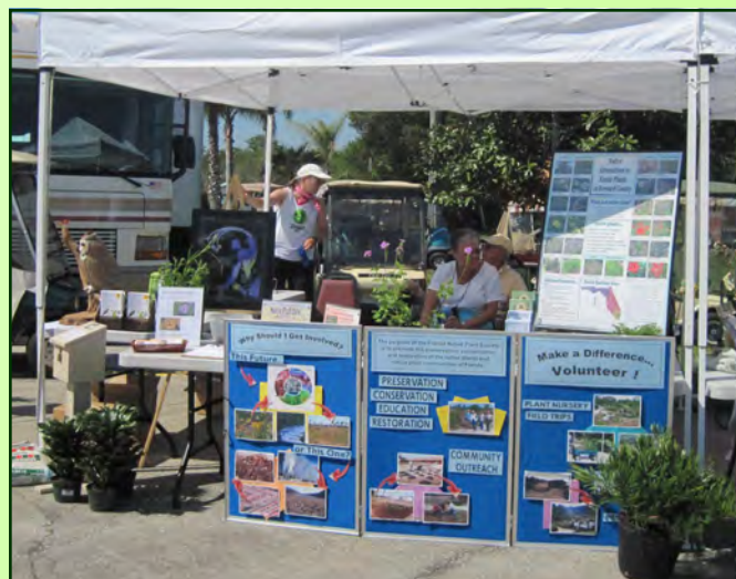
Sea Rocket's Education Exhibit at The Great Outdoors Fun Fair (above)

(Aren't these lousy photos? Can you do better? Contact Shari at jclark109@cfl.rr.com )