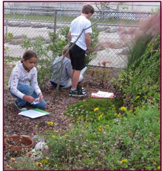
Students at South Lake Elementary observing native pollinators in the school butterfly garden

The Sea Rocket Board and I wish each of you a very merry holiday season, and we'll see you at Café Margaux!