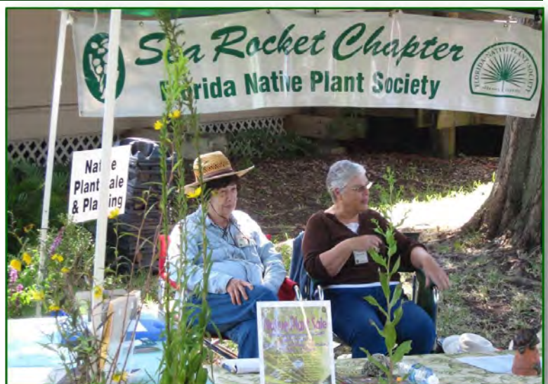
Sea Rocket Volunteers selling plants at Merritt Island National Wildlife Refuge