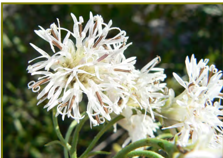
Palafoxia integrifolia

Plants were raffled and the meeting was adjourned at 8:45pm.