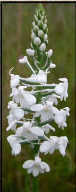
Platanthera nivea