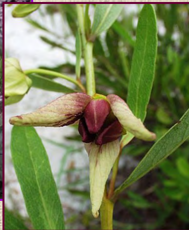
Asimina pygmea