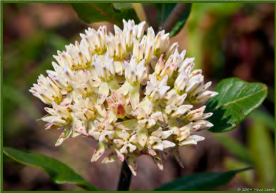
Asclepias curtissii