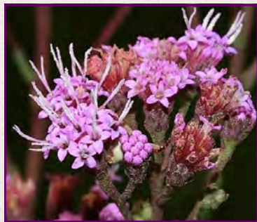
Vanilla Plant Carphephorus odoratissimus

Meeting site is Parrish Park Scottsmoor, a Brevard County park, which is about in the center of the eastern section of the Sanctuary.