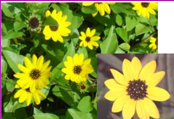
Beach Sunflower Helianthus debilis