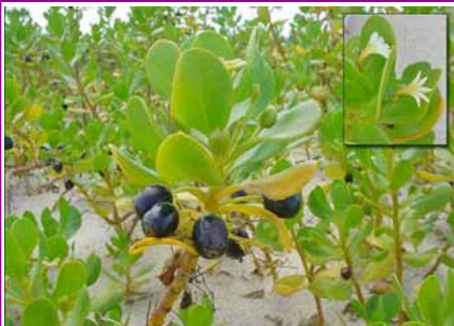
Inkberry - Scaevola plumieri

Directions: Bring hat, sunscreen, water & insect repellent. Take I-95 to S R 46 (Exit 223). Go West on SR 46 1.2 miles. Preserve entrance is along north side of SR 46 - a gravel road called Blake Lee Trail. Look for a sign marking conservation area entrance - the mail box is marked 5060. Go 0.3 miles north on gravel road to gate. Park in the grass left of the gate.