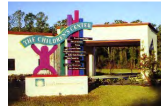
The Children's Center, Titusville

Tutoring Caregiving Medicaid Waiver Summer Camps