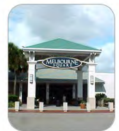
Melbourne Square Mall

Because Everyone Deserves A Fighting Chance