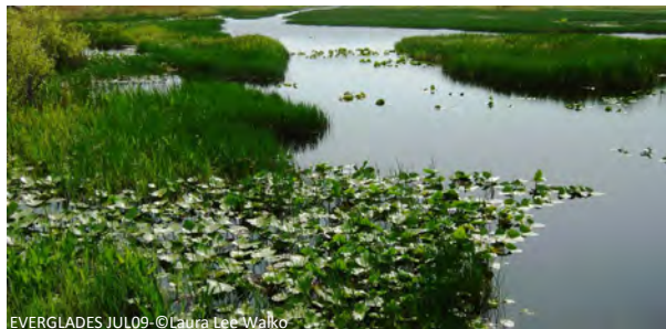
EVERGLADES JUL09

Proven Soil, Sediment, and Groundwater Remediation Technologies