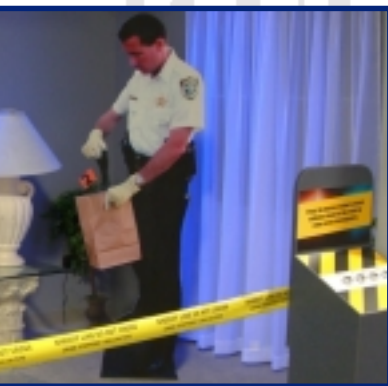
Crime Scene & Forensics Area