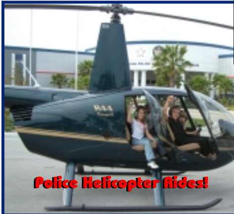
Police Helicopter Rides!

With Exhibits, Memorabilia & Collectibles, Theatre Presentations